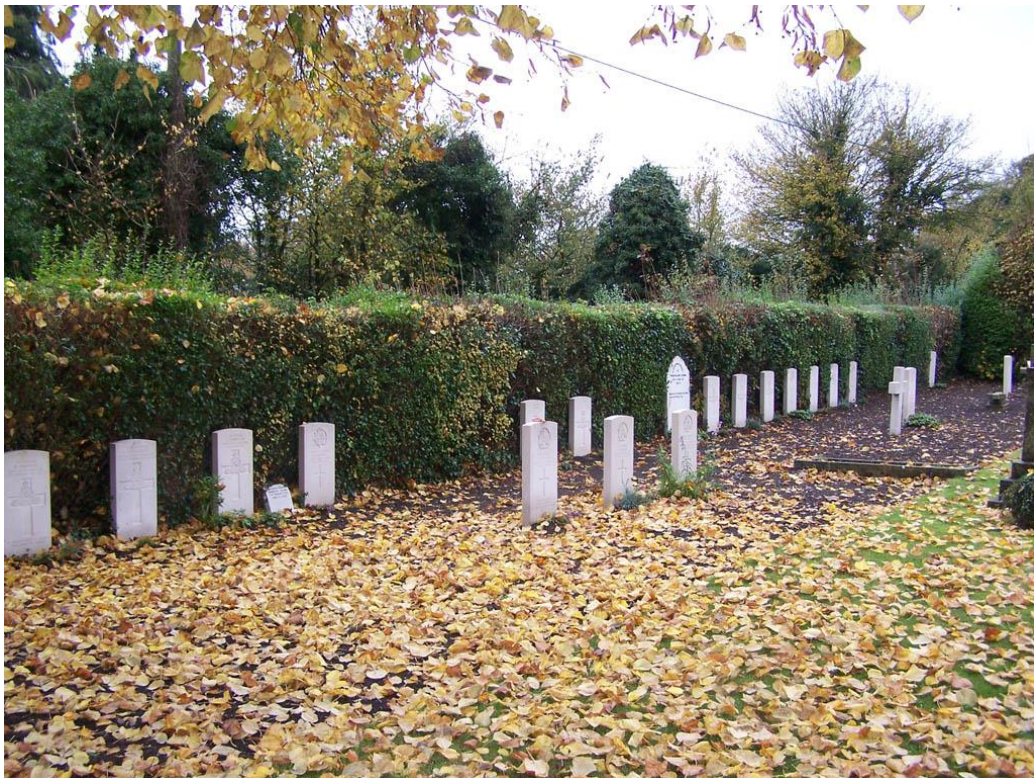
Bulford Church Cemetery