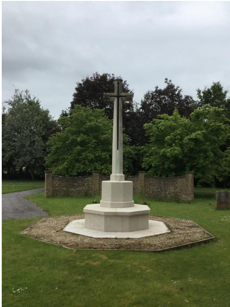
Cross of Sacrifice in Bulford Church Cemetery