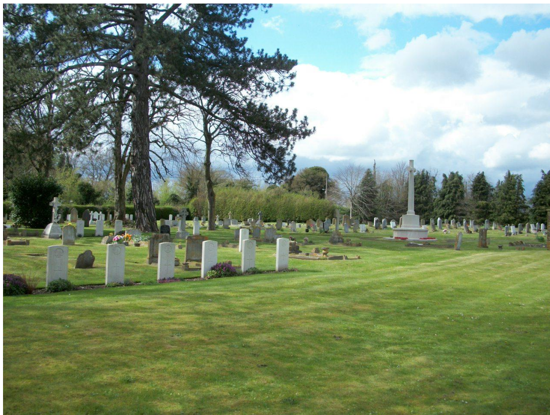
Bulford Church Cemetery